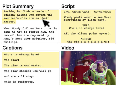
Figure 2: Users navigate in films using summaries, scripts, and captions, and across films with search (not pictured).

I extended interactive video abstractions to support searching and browsing in film – a domain where, unlike lecture videos, expertauthored texts already exist. In formative interviews, film professionals, including producers and scholars, revealed that they often searched for moments, settings, actions, or characters in film in order to communicate ideas and inform future art. To make tedious search tasks trivial, I created SceneSkim [6]. SceneSkim aligns existing documents including plot summaries (to revisit particular moments), scripts (to search and skim objects, actions, settings and characters) and captions (to search sound effects and dialogue) to each other and to the film (Figure 2). SceneSkim aligns caption words and their predicted phonemes to features in the audio, aligns the caption words to the script dialogue