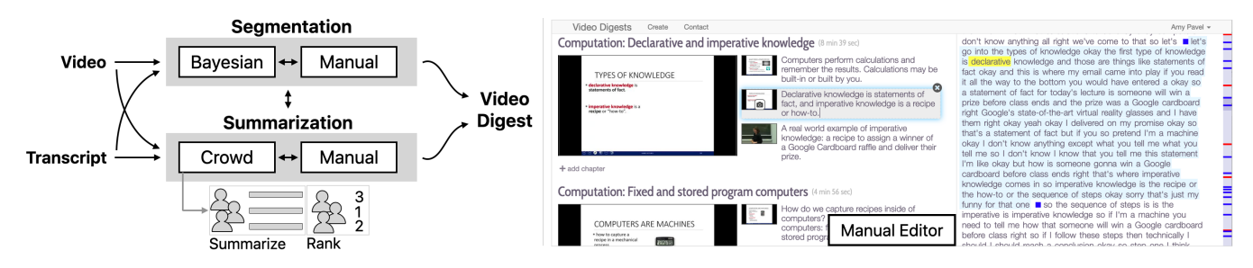
Figure 1: Video Digests system diagram (left) and manual transcript-based editing interface (right). Video Digests takes in a video and its transcript, and provides computational support for segmenting and summarizing, authors can manually refine its outputs using the editing interface.

A Video Digest [5] is an expert-inspired abstraction that enables students to search, browse, and skim lecture videos by linking videos to structured text representations with titled chapters and summarized sections. Creating a video digest by hand is time consuming – experts manually scrub back and forth along the video timeline, playing and pausing the video to identify each segment boundary, then summarize each section by watching the video to recall the content. As lecture videos convey most information via speech, I introduced interactive transcript-based segmentation and transcript-based summarization to help authors efficiently create video digests. To achieve high-quality digests, the system first segments the video into sections by applying Bayesian topic segmentation over a transcript time-aligned to the audio at word level (using HMM/Viterbi-based forced alignment), then uses a crowd-powered summarize-and-rank method to create section summaries. To group sections into chapters, the system re-applies topic segmentation over the crowd-sourced summaries. Authors can then refine the digest using the aligned transcript of the video in our manual authoring tool (Figure 1). In a study (N=192), people using manual and automated digests recalled more key points of the video than those using the video or